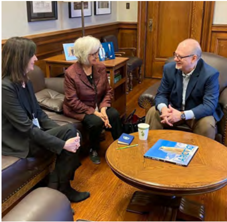
Meeting with Minister Goertzen to discuss the human trafficking issue in Manitoba.