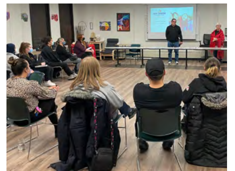
Providing sessions to service providers who work with vulnerable youth at Ndinawemaaganag Endaawaad.