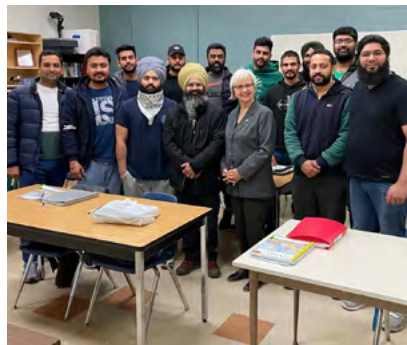
Training new taxi drivers about human trafficking and what to look for to help vulnerable youth that may be transported in their vehicles.