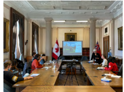
Speaking with Interns at the Legislature about human trafficking and how they can impact change in their communities.