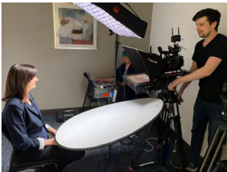
Filming for the National Human Trafficking Education Centre.