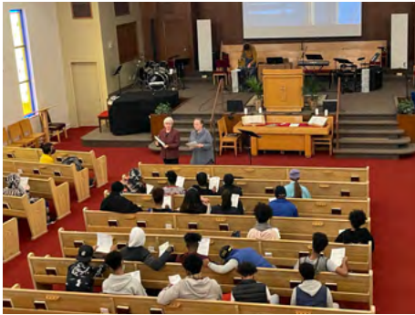
Presenting to Freedom International school and speaking with youth newcomers to Canada about what human trafficking looks like in our country.